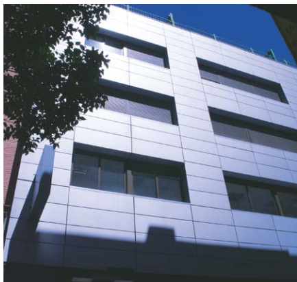
Madrid Center Campus

CEDEU University Center is one of the entities linked to the Foundation for Training and Future, founded in 1958. It has more than 40.000 students of 50 different nationalities.